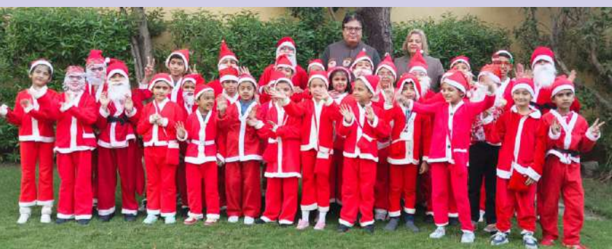
S. D. Jain Modern School, Wing-2, resonated with festive cheer on 23rd December 2023, as students donned red and white outfits to mark a joyous Christmas celebration. The day featured spirited caroling, lively dances, eye captivating skits and creative expressions through Christmas-themed drawings and crafts. Santa Claus was a prevalent theme, with students contributing to the festive atmosphere by decorating the Christmas tree.