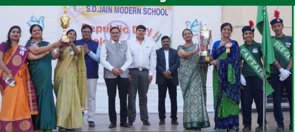
Runner Up House: Ashoka House