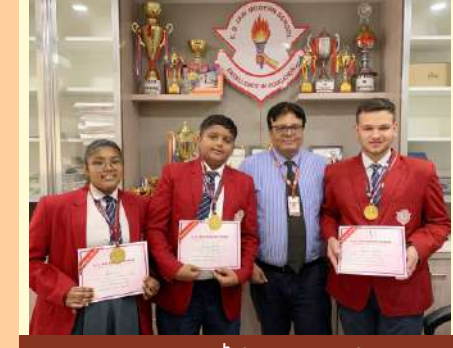
STD - 10<sup>h</sup> (2023-24)